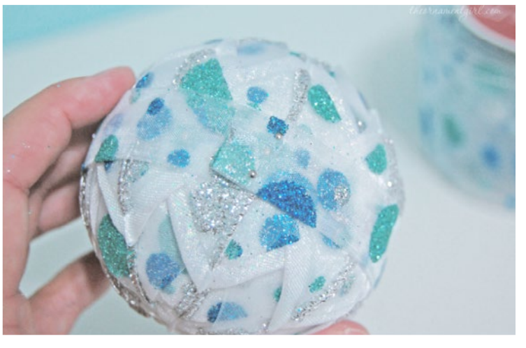
Not for sale or distribution. Do not share in any way, including online groups, social media, blogs, websites or in any other form (digital or printed) without the prior written consent of The Ornament Girl, LLC.